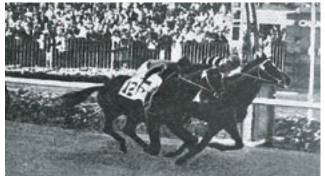
Hakuchikara won Washington's Birthday Handicap at Santa Anita, USA in 1959

dramatic increases in turnover as well as attendance, marking the birth of modern horseracing in Japan as it exists today.