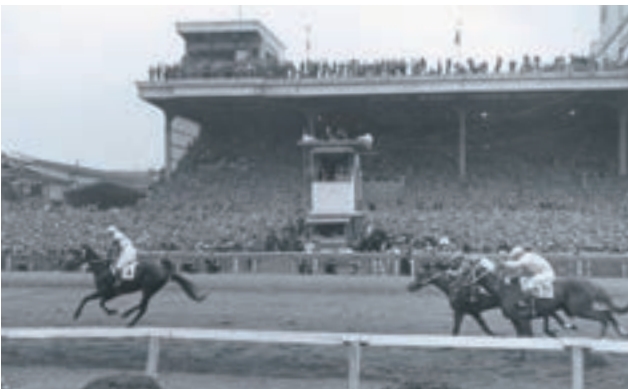
The JRA was established in 1954, the same year as the running of 21st Japanese Derby which Golden Wave won.

This reform brought about dramatic changes and improvements to horse racing in Japan, such as the establishment of JRA classic races like the Japanese Derby. There were also