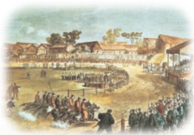
Samurai horseracing at Yokohama Racecourse in 1865

However, this profitable system was short lived; two years later, the government prohibited betting and instituted a system of paying direct subsidies for prize money and other horseracing expenses.