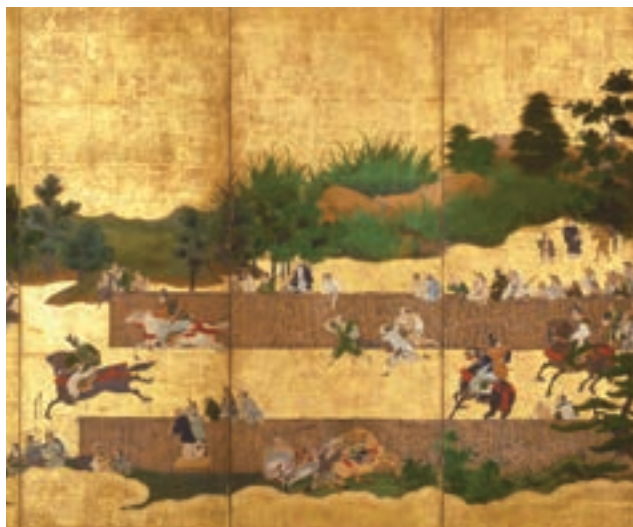
Horseracing event at Kamigamo Shrine in Kyoto (Edo Period)