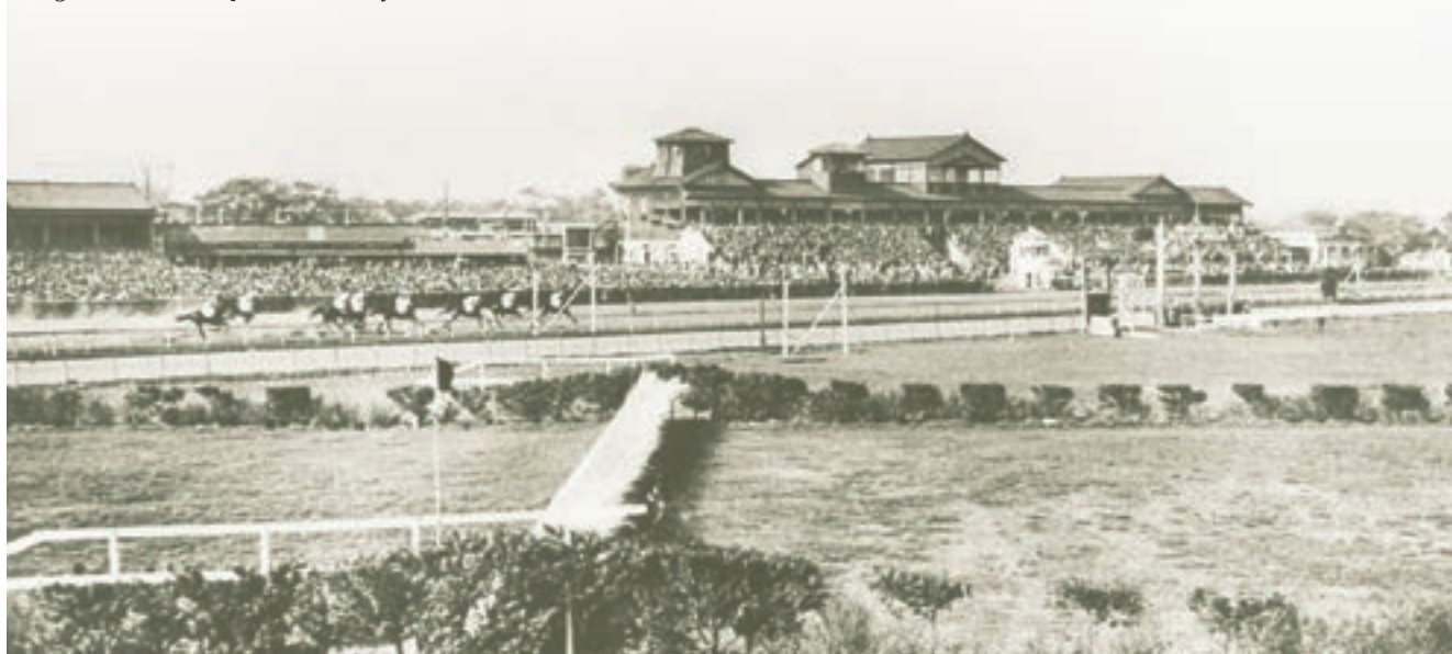
The first Japanese Derby held at Meguro Racecourse (Tokyo) in 1932